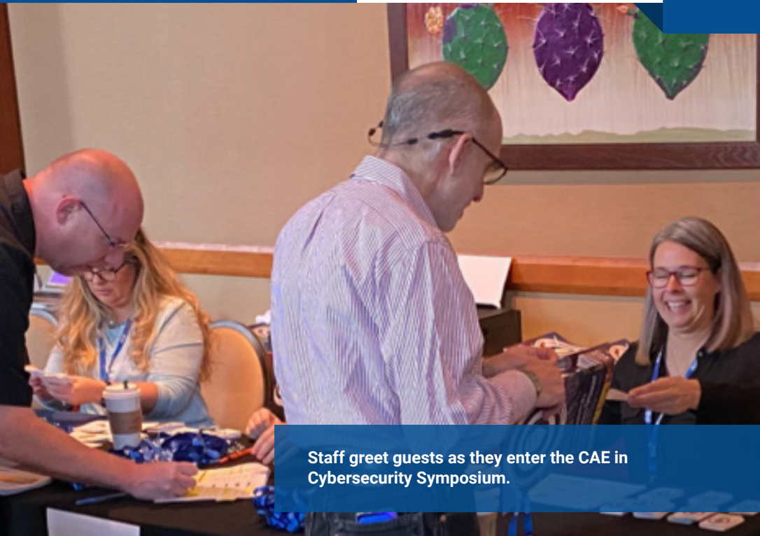
Staff greet guests as they enter the CAE in Cybersecurity Symposium.