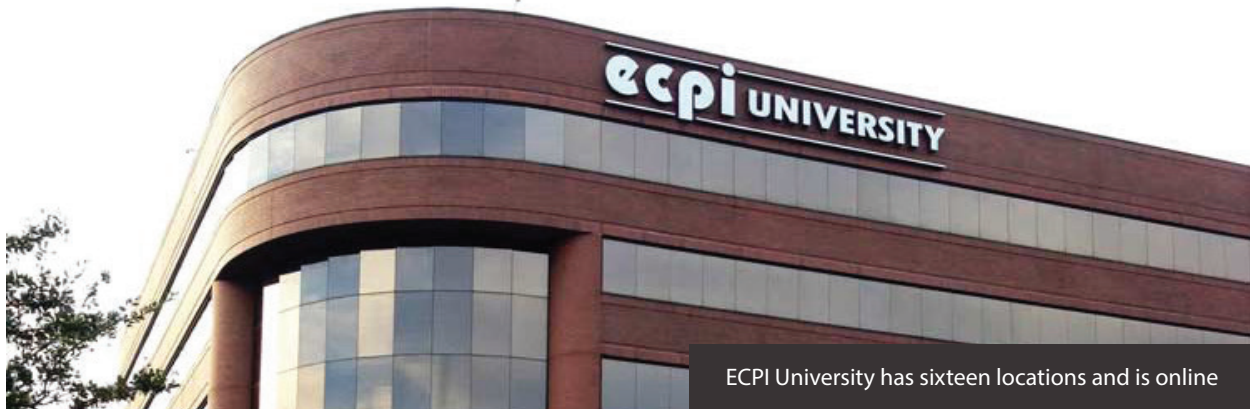
ECPI University has sixteen locations and is online

Since 1966, East Coast Polytechnic Institute and University (ECPI University) has been dedicated to providing students with education that leads to careers through a hands-on, accelerated learning environment. Smaller class sizes, dedicated faculty and career service representatives, flexible scheduling options, and a military friendly atmosphere are just some of the unique aspects that set us apart. As a designated Center of Academic Excellence in Cyber Defense Education, ECPI University is proud to meet the stringent guidelines for our expertise in cybersecurity education and are committed to preparing students for careers that protect our nation’s digital landscape.