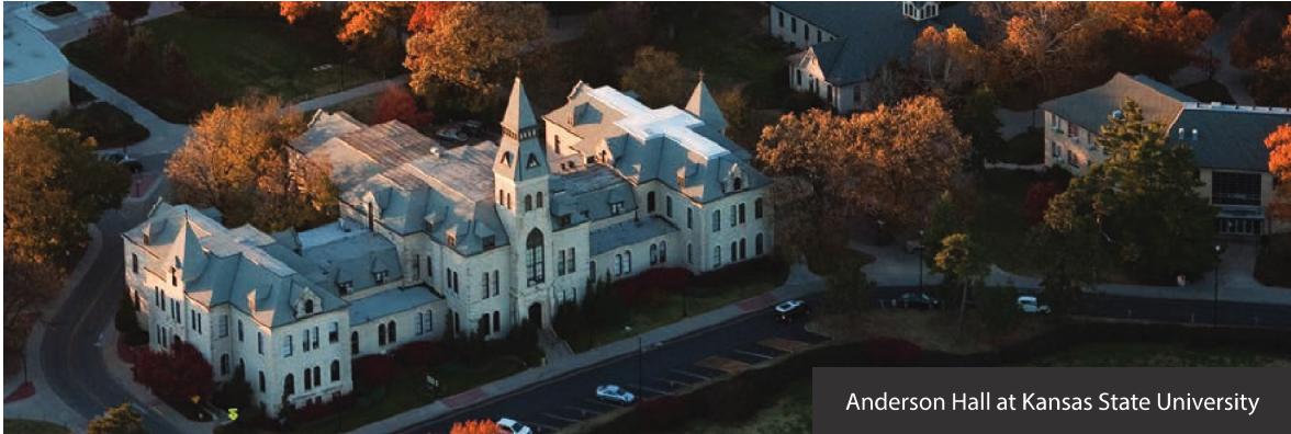
Anderson Hall at Kansas State University

The Center for Information and Systems Assurance (CISA) at Kansas State University has been designated as an NSA/DHS National Center of Academic Excellence in Cyber Defense Research since 2010. The mission of CISA is to: