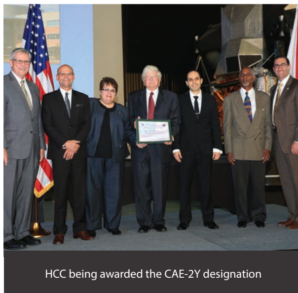
HCC being awarded the CAE-2Y designation