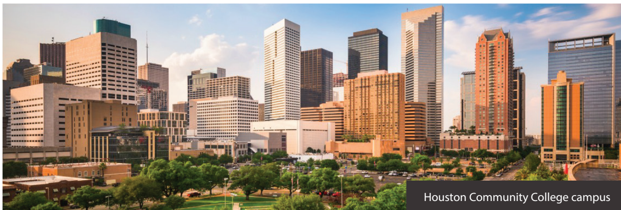
Houston Community College campus

Houston Community College (HCC) is composed of 15 Centers of Excellence and numerous satellite centers that serve the diverse communities in the Greater Houston area by preparing individuals to live and work in an increasingly international and technological society. HCC is one of the country's largest singly accredited, open admission community colleges offering associate degrees, certificates, workforce training, and lifelong learning opportunities.