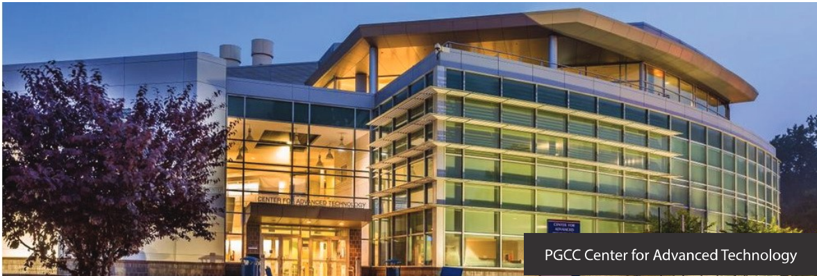
PGCC Center for Advanced Technology

The Cybersecurity program at Prince George's Community College provides the broad-based knowledge and skills necessary to prepare students for work as security analysts and administrators. Program topics include, but are not limited to the following: threats and vulnerabilities, governance, risk, compliance, legal and ethical issues, identity and access management, physical security, security engineering, fundamentals of cryptography, security testing, and security operations. Students also complete a capstone project that includes designing and implementing an information security system. Students completing this degree and related certificate program(s) will also be able to use their demonstrated knowledge and skills to prepare for industry recognized certifications. Students planning to pursue a bachelor's degree in Cybersecurity or related programs (Information Technology,