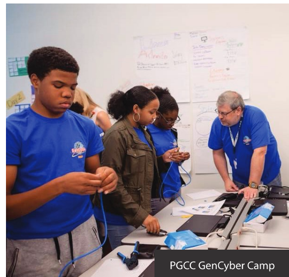
PGCC GenCyber Camp

pgcc.edu/programs-courses/ program-finder/cybersecurity-aas