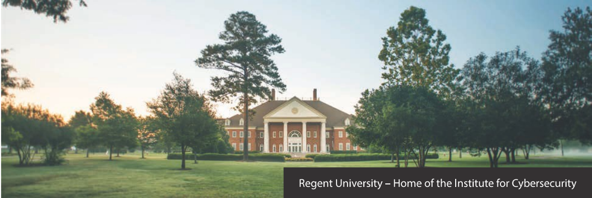
Regent University – Home of the Institute for Cybersecurity

Regent University was named as a National Center of Academic Excellence in Cyber Defense Education (CAE-CDE) by the National Security Agency (NSA) and the Department of Homeland Security (DHS). According to the latest data published by NICE (National Initiative for Cybersecurity Education, 2018), Regent is among only four percent of universities in the United States to receive this merit.