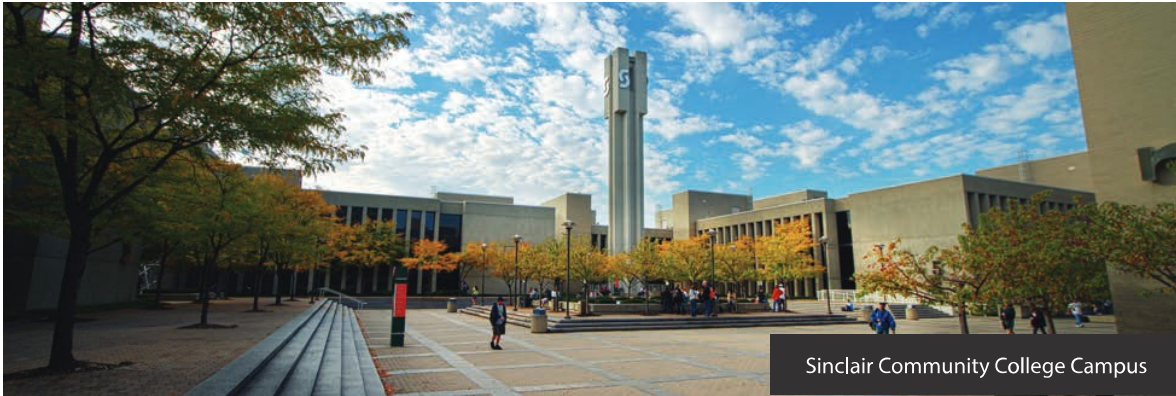
Sinclair Community College Campus

Sinclair Community College is an urban community college located in downtown Dayton, Ohio. Founded in 1887, it is one of the oldest community colleges in America. Today, it is the region's choice for post-secondary education. Sinclair Community College was first designated as a Center of Academic Excellence in Cyber Defense in 2011. Since then, Sinclair has maintained its CAE-CD designation while continually growing and advancing in the cyber field. Cyber Defense is a major focus in the Miami Valley region due to the proximity of the Wright Patterson Air Force Base, defense contractors, and strong local healthcare providers. The college offers different teaching modalities including more traditional and competency based to serve our diverse student population. Sinclair utilizes a sandbox learning environment to train students in defend against popular cyber-attacks.