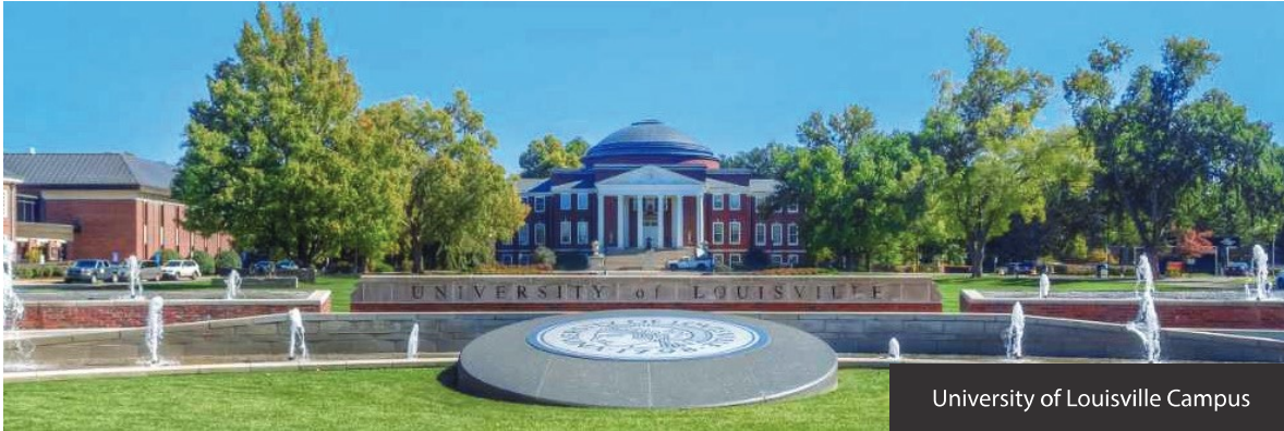
University of Louisville Campus

The University of Louisville is a state supported research university located in Kentucky's largest metropolitan area. It was a municipally supported public institution for many decades prior to joining the university system in 1970. The University has three campuses. The 287-acre Belknap Campus is three miles from downtown Louisville and houses seven of the university's 12 colleges and schools. The Health Sciences Center is situated in downtown Louisville's medical complex and houses the university's health related programs and the University of Louisville Hospital. The 243-acre Shelby Campus is located in eastern Jefferson County.