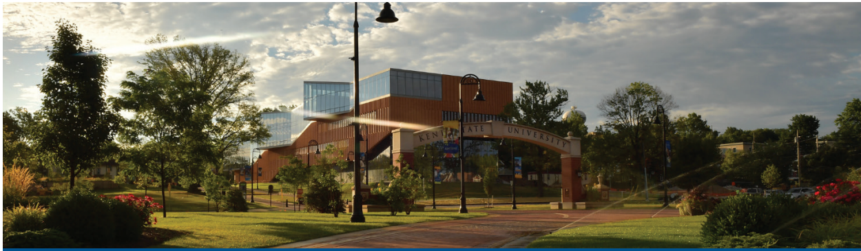
Kent State University Campus Entrance View

Kent State University serves the Northeast Ohio region with its Cybersecurity programs in collaboration with the regional community colleges. The programs offer hands-on experiences in networking, cybersecurity operations, wireless networking, and computer hardware. In addition, the college offers opportunities for cybersecurity analysis projects for drone air traffic management, unmanned flight operations, mechatronics engineering concepts such as robotics and automation.